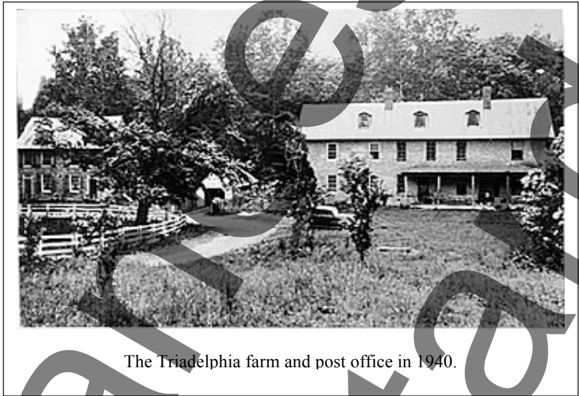
The Triadelphia farm and post office in 1940.